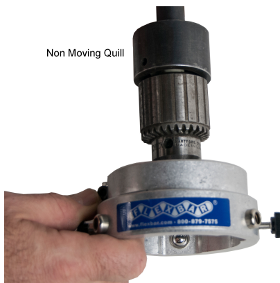
Non Moving Quill

If your clamp and or bushing will not tighten sufficiently on Quill, please install shim.