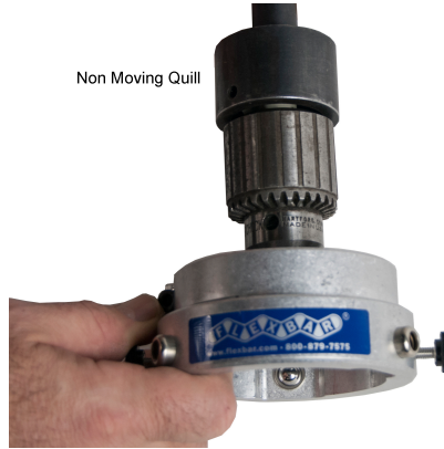
Non Moving Quill

If your clamp and or bush-ing will not tighten suffi-ciently on Quill, please install shim.